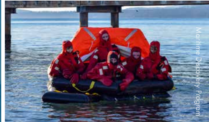
Maritime Discovery Program