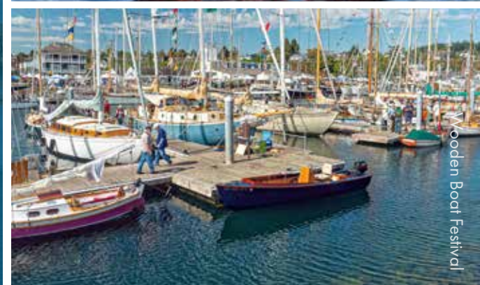
Wooden Boat Festival