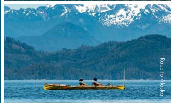
Race to Alaska