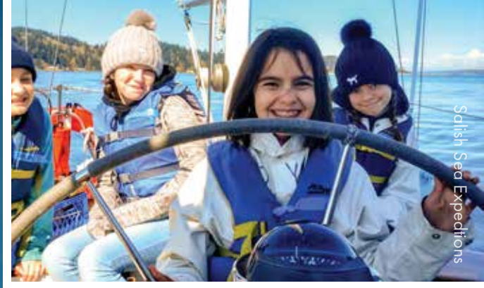
Salish Sea Expeditions