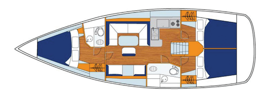
41' Bareboat | 3 cabins $5,854.59 per boat | $1,951.53 per cabin | $975.00 per person