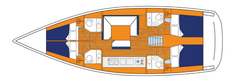
47' with NWMC Captain | 3 cabins + captain cabin $2,965.96 per cabin | $1,483.00 per person