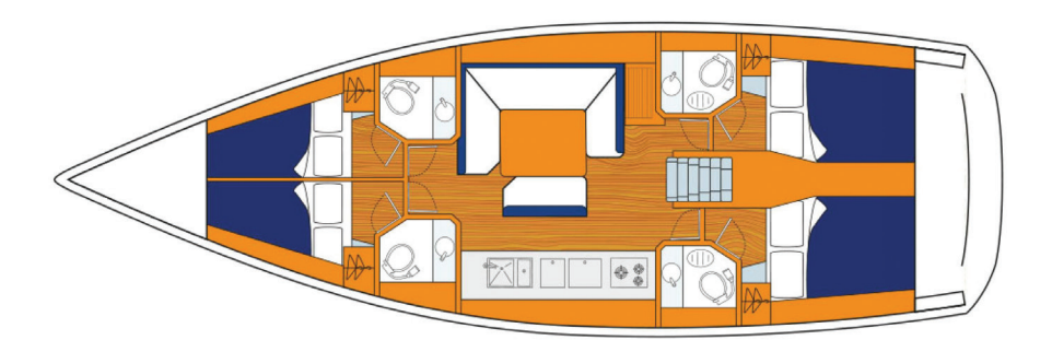
47' Bareboat | 4 cabins $7,397.88 per boat | $1,849.47 per cabin | $925.00 per person