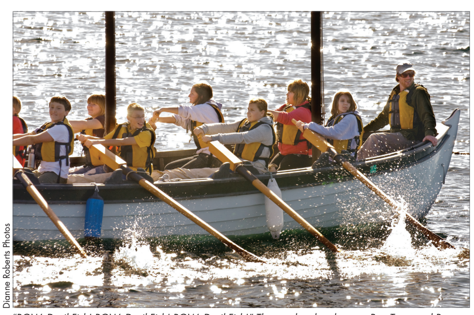
"ROW, Devil Fish! ROW, Devil Fish! ROW, Devil Fish!" The words echoed across Port Townsend Bay, in the age-old tradition of chanting to the rhythm of the oars. Devil Fish? The team name chosen by the young crew. The rowers: Chimacum seventh graders, participants in the Maritime Discovery program.

In longboats, students learn seamanship and teamwork. They develop a sense of self and place within our region's important maritime history. We teach mathematics through navigation; language arts through maritime nomenclature and poetry; and science through the study of weather. Students learn to recognize their personal strengths through lessons fostering responsibility, teamwork, leadership, and interdependence.