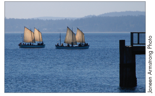
With balmy weather, fair winds and clear skies, the sails are raised for a leisurely drift across the bay. Vancouver and Shackleton never had it so good.