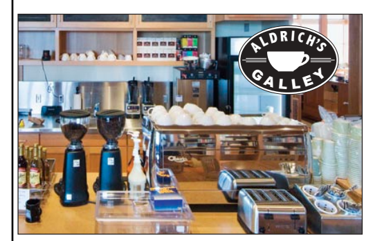
Aldrich's Galley: the new place to meet on the waterfron