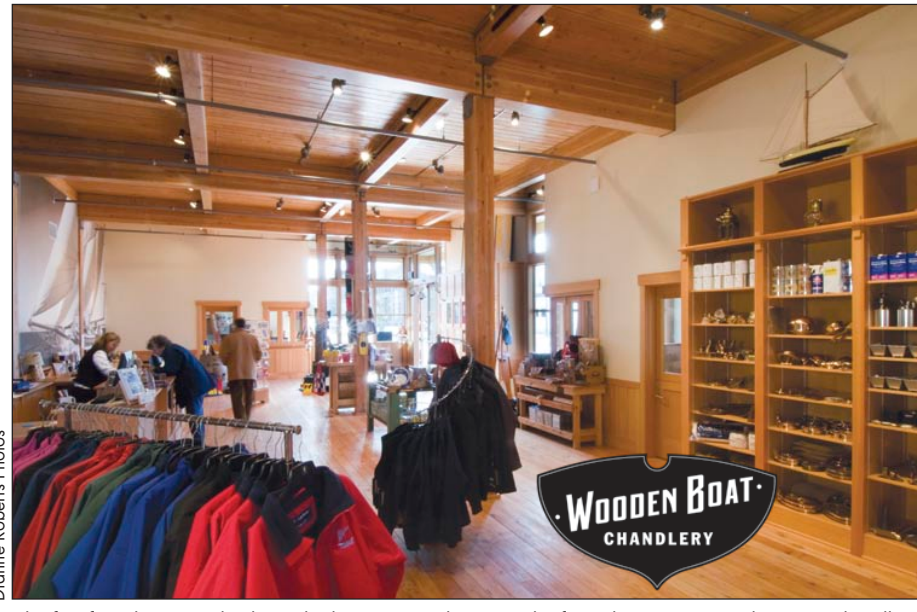
The first few shoppers check out the latest nautical gear and gifts in the NEW! Wooden Boat Chandlery.

pening Day of the 2010 boating season is also the first official day the entire Northwest Maritime Center & Wooden Boat Foundation waterfront campus will be fully open.