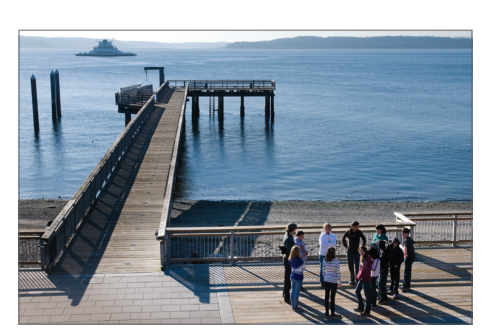
The day begins with team-building on the shore, in preparation for pulling together in the longboats.

The program has two components: "Discovery" and "Challenge." The Discovery component currently serves every seventh grade student in Port Townsend and Chimacum School Districts – about 210 total – in a multi-week maritime curriculum. (Port Townsend classes are in the spring.) Each student spends at least two days on the water in longboats – replicas of the sturdy craft used by Captain Vancouver in his 1792 survey expedition of Puget Sound. The remainder of their time is spent in classrooms, with teachers centering lesson plans around maritime content.