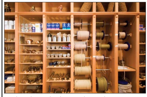
Cordage, bronze hardware, oakum and pine tar..