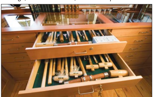
.hammers, and chisels and mallets, oh my!