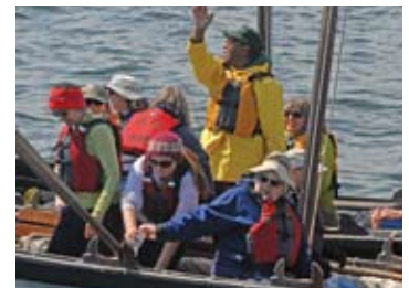
top: 7th Grade students in the Discovery Program "give way together."