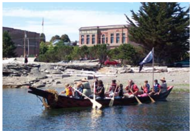
Jamestown S'Klallam Tribe members share a canoe ride with "Messing About..." youngsters.