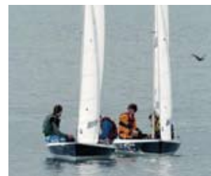
Sailing team in light winds on Port Townsend Bay.

The first season back after a ten-year hiatus was a winner. Twenty students—from Port Townsend High School and local alternative schools, plus home-schoolers—came together as one team to compete against 28 teams from around the Pacific Northwest, finishing in the middle of the pack. It was an extraordinary accomplishment for a brand new team. The team practices twice a week on Port Townsend Bay and races nearly every weekend during the season.