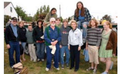
Sea Scouts receive a send-off from Governor Chris Gregoire.

The NWMC Sea Scout Ship (SSS) Falcon —in its tenth year—hosted a Sea Scout regatta at Fort Flagler, placed second in the Pacific Challenge Longboat Competition at Aberdeen, crewed on the schooner Martha , and took a ten-day longboat cruise through the San Juan Islands. Currently, there are two Quartermaster candidates and an Able candidate in their ranks. Quartermaster is the highest rank in Sea Scouts.