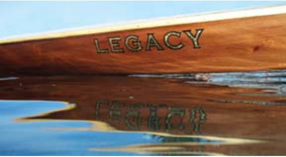
The Port Townsend Pocock Classic cedar single, Legacy , touches water for the first time.