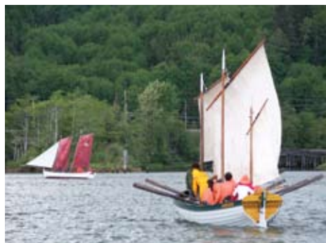
Competing in the Pacific Challenge at Grays Harbor.

Now in its 13 th year, the Explorer program's two teams of high school students develop marine-trade skills by maintaining the longboats, and gain on-the-water experience that concludes with participation in the Pacific Challenge.