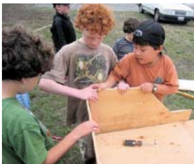
Building a pirate ship takes teamwork, diligence and AAARGHIMAGINATION.

Junior Pirates and Junior Mariners are the themes for Messing About in Boats Sea Camp. Now in its fourth year, the program is flourishing. Sixty-five participants, ages 7 to 10 years, learned to row a skiff, drive a powerboat, steer a large sailboat, build a boat, search for buried treasure and tie important knots, while soaking up maritime lore.