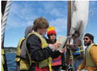
Learning to set the dipping lug sails on the longboat Bear .